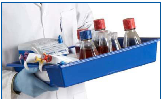
Use for storage or transport of laboratory products